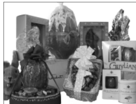
Some of the fabulous prizes that were donated for the third annual Grand Easter Egg Draw