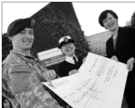
Staff from MCC Maritime Component Command Northwood presented a cheque for £350 to the LJMC. The Morale and Welfare Committee raised the money through a variety of different social and sporting activities.