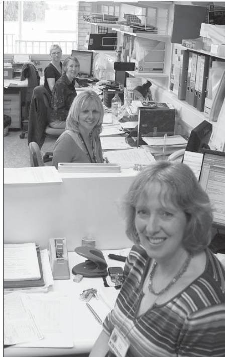
Members of SORT in their new office

Where once we had been able to pop next door and have a chat face-to-face, we either had to pick up the telephone or face the trek across the site – delightful in the summer but less appealing in the wind and rain.