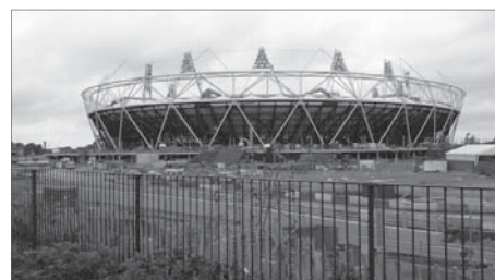
We were delighted that Blue Badge tour guide, Sonya Grist , offered to run another tour of the sites for the 2012 Olympic Games. This quickly sold out and raised £300.