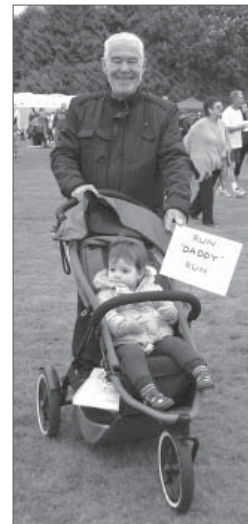
It's a great family day