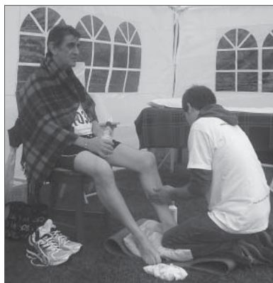
Members of the LJMC Complementary Therapy team and physiotherapists from BMI Bishops Wood Hospital provided an invaluable service for weary legs

Meanwhile, thank you to everyone who contributed to this year's event (see opposite page).