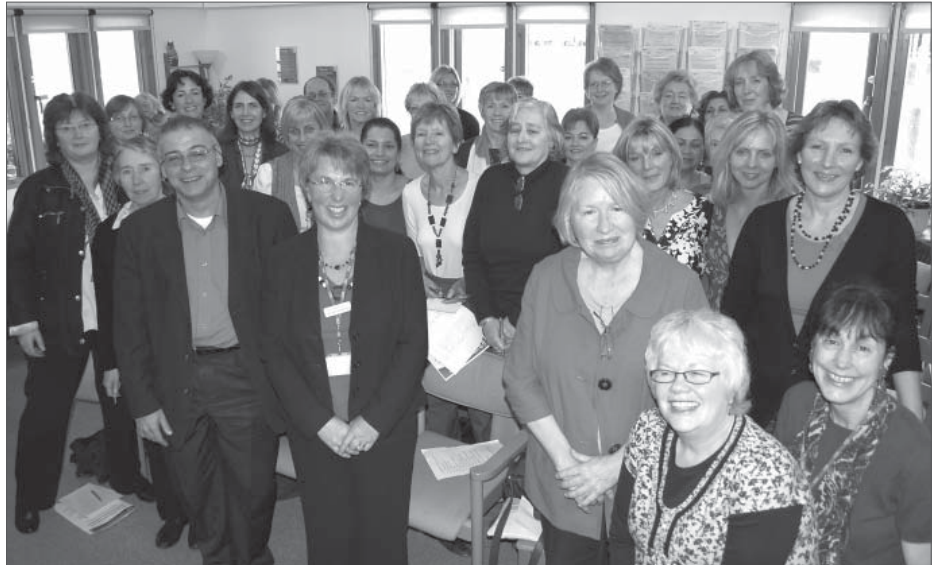
More than 70 people work at the Lynda Jackson Macmillan Centre. We're a friendly team and welcome more people to join and help us provide our services for people affected by cancer.

More than half of the LJMC team works in a voluntary capacity and the centre could not provide its extensive services without such valuable contributions.