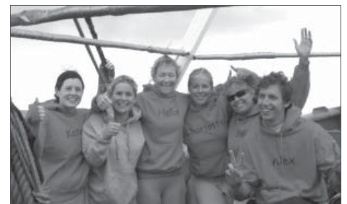
At the time of writing, the total raised exceeds £7,200. Thank you and congratulations!

For all of us, completing the swim was a personal triumph, facing challenges which turned out to be so much greater than we had anticipated, but also we are grateful that our effort has raised much needed money to help people facing a very different type of challenge but one that's every bit as daunting.