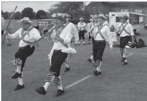
Woodside Morris Men added to the great atmosphere by entertaining the crowds between races

really competitive so I had to aim to beat it.”